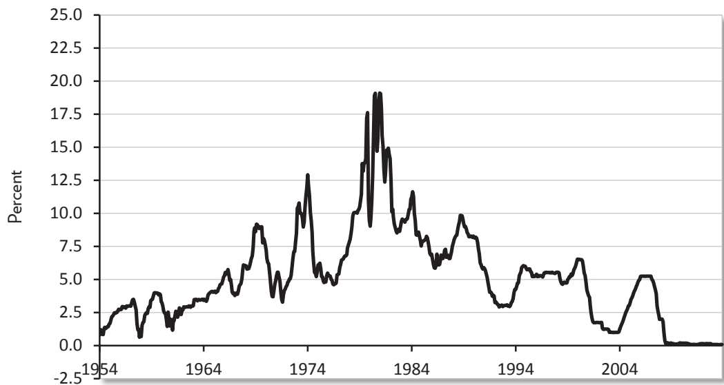
Figure 1 Effective Federal Funds Rate (FEDFUNDS)